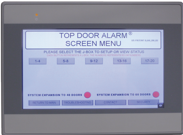
Room Setup and Troubleshooting Password protected to limit access