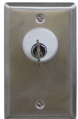
Keyed Reset Switch