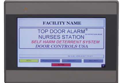
Touch Screen Display Panel